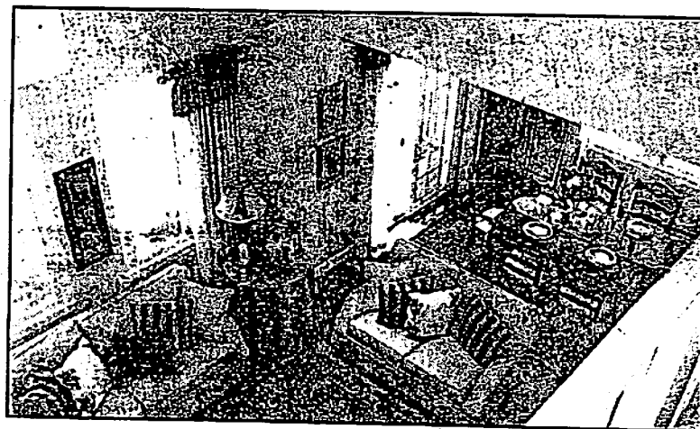
View from the loft of one of the new Village at Duxbury Garden Homes shows the living room dining room area.